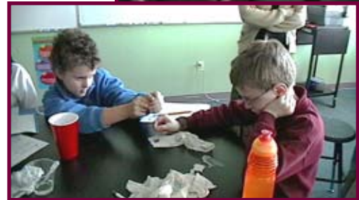
5 th Grade Shadow Day